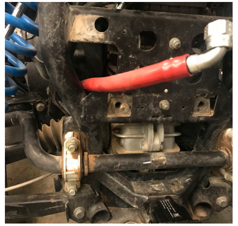
13. Install new oil drain line and route to back, making sure that it doesn't hit drive line.