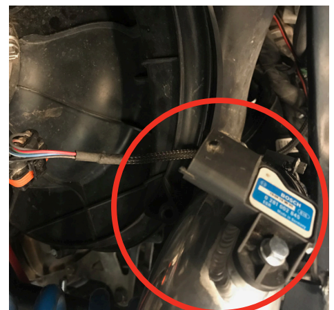
21. Install map sensor from Power Commander. IF YOU UPGRADED TO A POWER VISION, YOU DON'T NEED TO DO THIS.