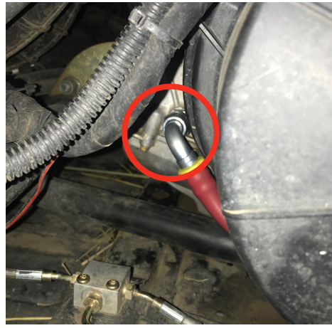
12. Install oil drain fitting into case.