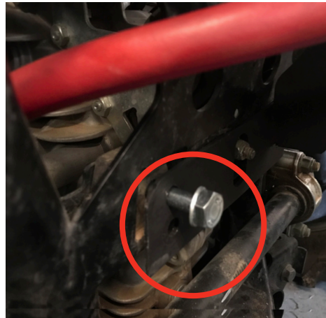
17. Install provided mounting bolts to bottom bracket through stock rubber mounts & bolt on the back side.