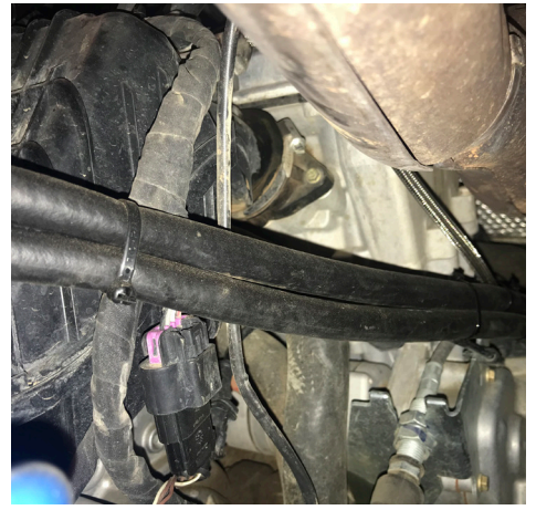
10. Zip tie lines away from exhaust.