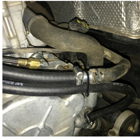
9. Run coolant line to the back of the vehicle.