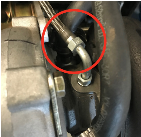
18. Install oil line to the turbo.