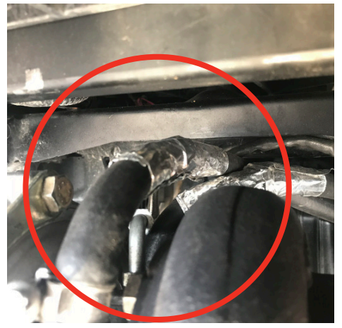
15. Install coolant lines to it BEFORE you mount the turbo assembly and wrap them with heat tape provided.