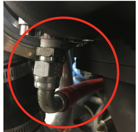
19. Install oil drain into the bottom of the turbo assembly.