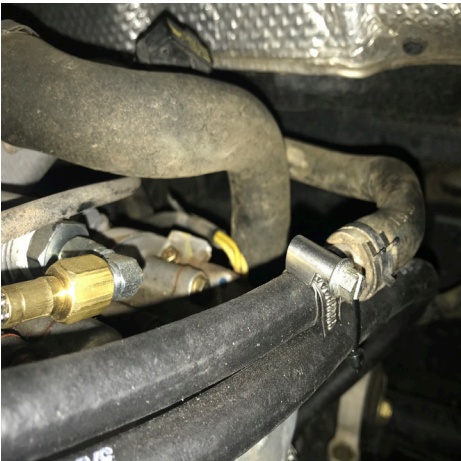
8. Install coolant line with coupler into stock hose that was take off from water pump.