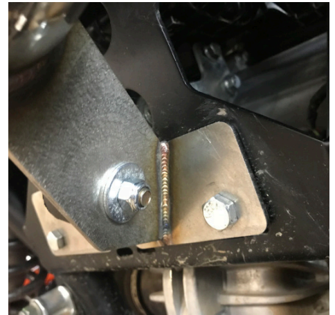
In systems with a Reduced Sound Muffler, this was done before (on step 14.b)