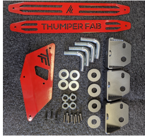
Hardware for Driver's Side Nerf Rail Pictured